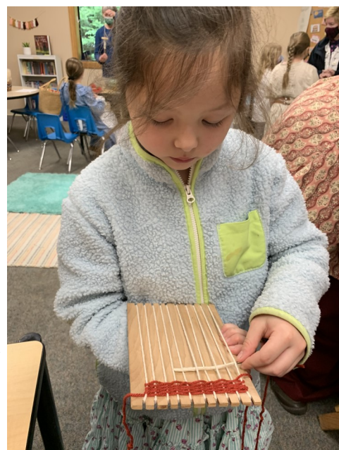
A young student shown with her weaving project as part of the hands on lesson.